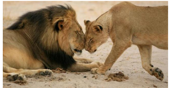
Cecil with a lioness