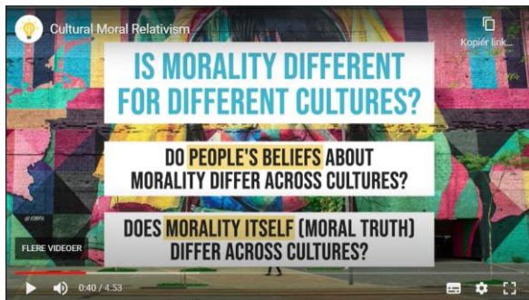
A YouTube video, made by Thinking About Stuff https://youtu.be/Npm-7DqMqM