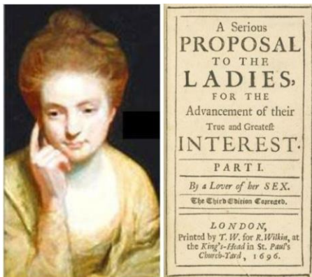
Mary Astell (1666-1731)